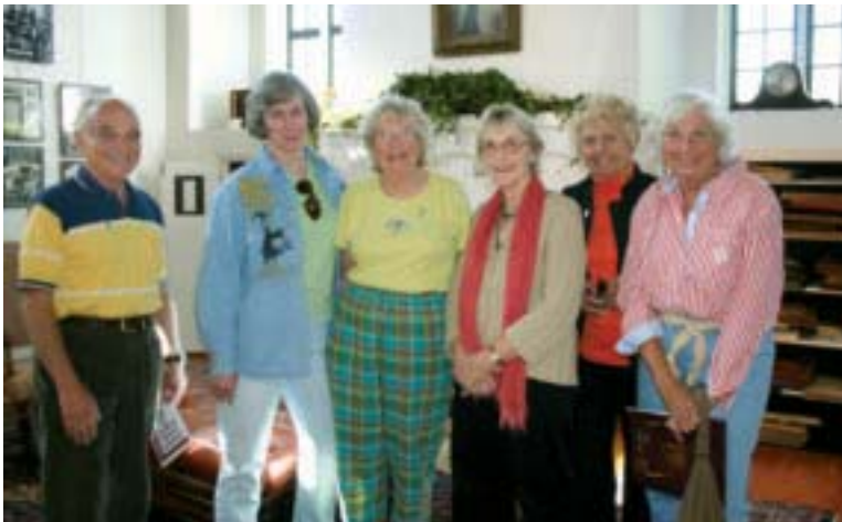
Retired Bishop's teachers and staff at the history exhibition.