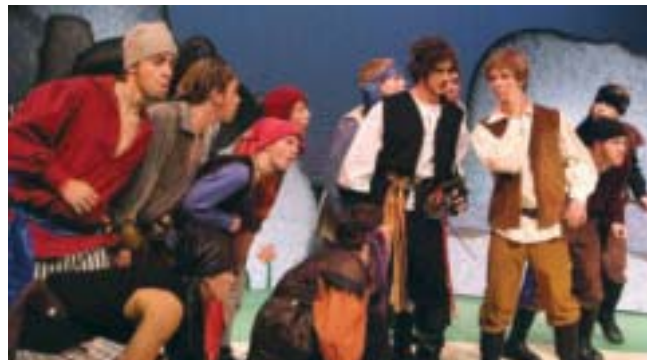
Pirates of Penzance